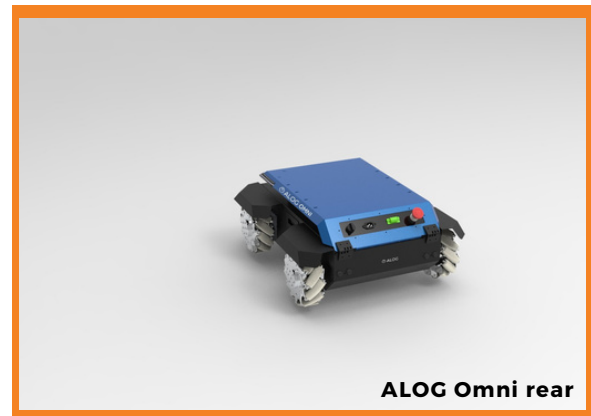
ALOG Omni rear

ALOG is a deep tech startup developing autonomous systems to improve productivity in logistics, retail, and manufacturing industries.