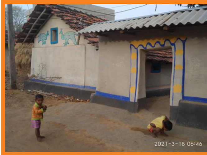
Rural living in Chhatna (a village in west Bengal)

Conclusion: As there are many issues rising, the whole world is trying to capitalize over this problem and to make this world a better place for the upcoming generation so that no people have to sleep in hunger and no people have to be homeless